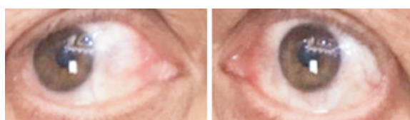
Figure 3: Eighteen months from the onset of surgically induced necrotizing scleritis shows complete healing in both eyes.

provisional diagnosis according to the sequence of events and the examination. We stopped the previous treatment and commenced him on oral prednisolone (1 mg/kg) tapered over six weeks besides topical tobramycin ointment qid, topical Ketorolac tid, and lubricant eye drops (preservative-free and contains hyaluronic acid 0.18%) q.2h.